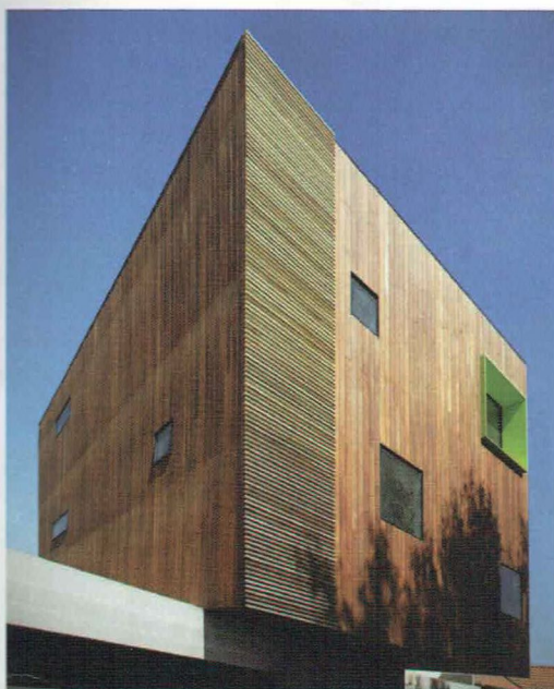
Bold container for a contemporary home – Hans House by MODO

In future issues, we will present exclusive interviews and images from this year's Australasian competitions, and from the UK Wood Awards, which were also judged around the same time. ■