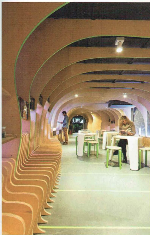
'The Martian Embassy', Sydney by Lava Architects.