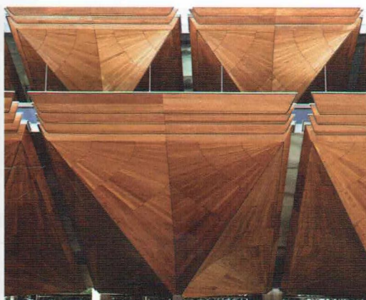
Auckland Art Gallery by Francis-Jones Morehen Thorp.