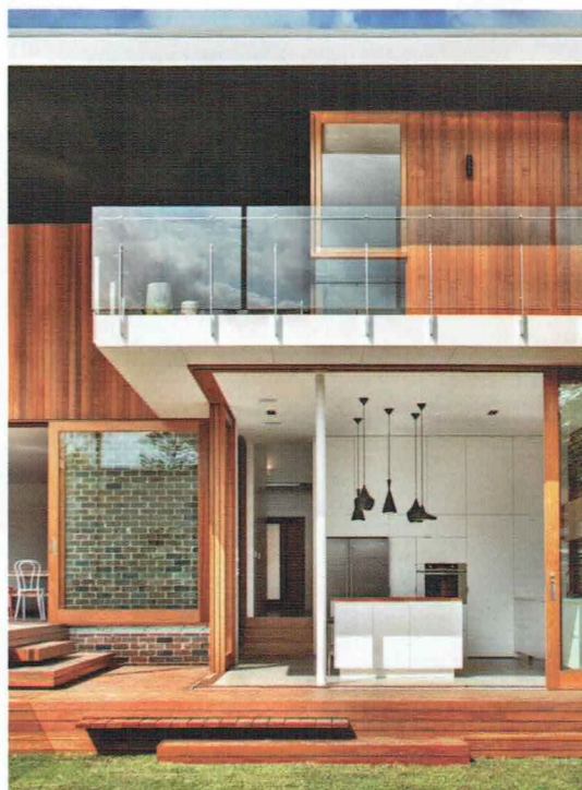
LEFT: Castlecrag House by CplusC Architectural Workshop