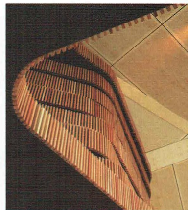
Stokehouse restaurant, River Quay, Brisbane by Arkhefield.