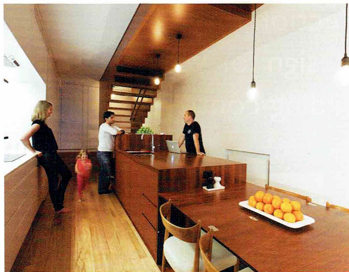
Hans House by MODO.

JURY COMMENT The Hans House is an energetic residence for a young Melbourne family. Responding to the client's brief for a home that played an active role in their everyday life, the emerging design practice responded with a bold container for contemporary living. The building's exterior form responds directly to the different spaces inside. A timber-clad box containing the bedrooms and bathrooms rests on a robust, masonry ground floor structure that contains the active, living spaces. The cantilever of the carefully detailed box marks the entry point for the house, while the underside becomes the ceiling for the ground floor. At the rear of the house the form of the box becomes the canopy for an intimate courtyard.