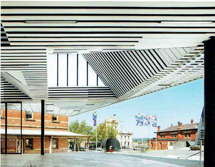
Saltwater Coast Lifestyle Centre by NH Architecture.

JURY COMMENT Situated near Point Cook, twenty kilometres west of Melbourne, Saltwater Coast is a new housing subdivision that will contain more than 2,500 homes when completed. The Lifestyle Centre is a focus for the emerging community and acts as both a community centre and a private recreation club. It contains sporting facilities, a cafe and a multipurpose function space. The bold, singular form of the pavilion is clad in spotted gum and it's this striking use of timber that communicates the building's civic aspirations within the suburban setting. The Saltwater Coast Lifestyle Centre is an exemplar for the formal and material possibilities of timber.